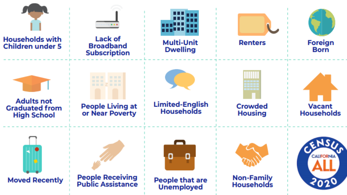
Figure 1 | California Outperformed Other States

While the focus of the Campaign was only California, the state's Self-Response Rate was often compared to other states. As detailed in the "California's 2020 Census Efforts were Historic" infographic, 22 of the 10 largest states, California had the highest average Self-Response Rate in hardest-to-count areas. In addition, as Figure 1, created by the Census Office external affairs and media relations team shows, California outperformed other states in getting people in all 14 hard-to-count groups to respond to the 2020 Census.